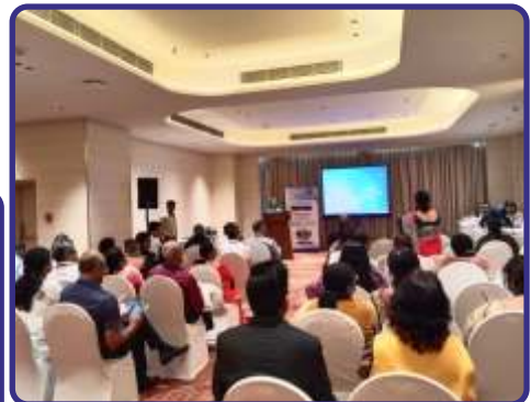
DLA held on 17 th May at Hyatt Regency Hotel. Members attended-6 Spouse-1